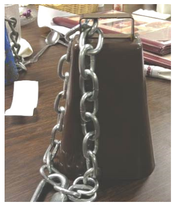
3 new brown bell

The cow bell rules are: If you get stuck and are unable to move under your own power and need the help of a winch or you get strapped from one of your fellow jeepers then you have earned the privilege of hanging a cow bell from your front bumper. You must leave the cow bell on the front of your rig until another Dirt Devil gets stuck then, you can proudly hand it over.