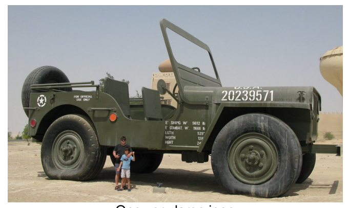
One very large jeep