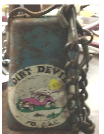
1 Old green cow bell.

Old Blue Mike Maneth Calico February 2012