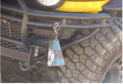
Proudly displaying the Cow Bell.

The cow bell rules are: If you get stuck and are unable to move under your own power and need the help of a winch or you get strapped from one of your fellow jeepers then you have earned the privilege of hanging a cow bell from your front bumper. You must leave the cow bell on the front of your rig until another Dirt Devil gets stuck then, you can proudly hand it over.